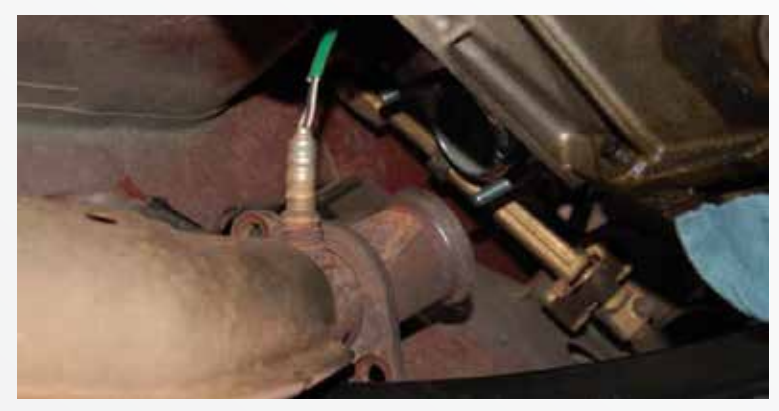
Remove the nuts at the collectors for the mid-pipe and drop the mid-pipe down and back, out of the way.