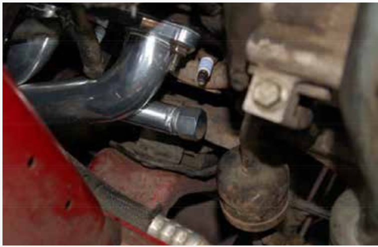
Install the provided steel caps on front EGR ports if not used. If used, connect the tubes.